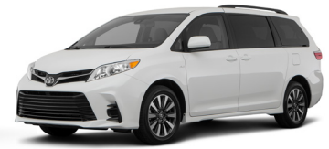
2020 Toyota Sienna