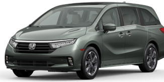
2021 Honda Odyssey