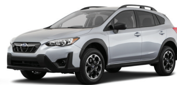
2021 Subaru Crosstrek