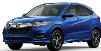
2021 Honda HR-V