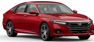
2021 Honda Accord