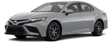
2021 Toyota Camry