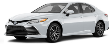
2021 Toyota Camry Hybrid