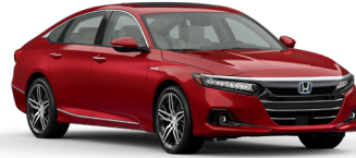
2021 Honda Accord Hybrid