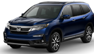
2020 Honda Pilot