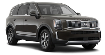
2020 Kia Telluride