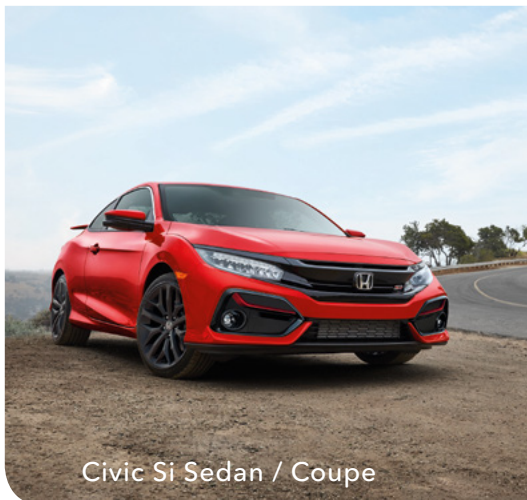
Civic Si Sedan / Coupe