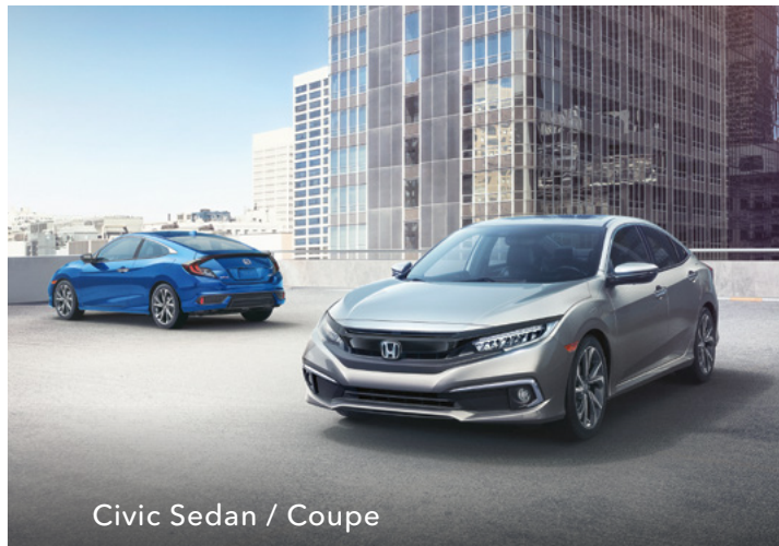
Civic Sedan / Coupe