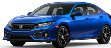
2020 Civic Hatchback