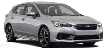
2020 Impreza 5-Door