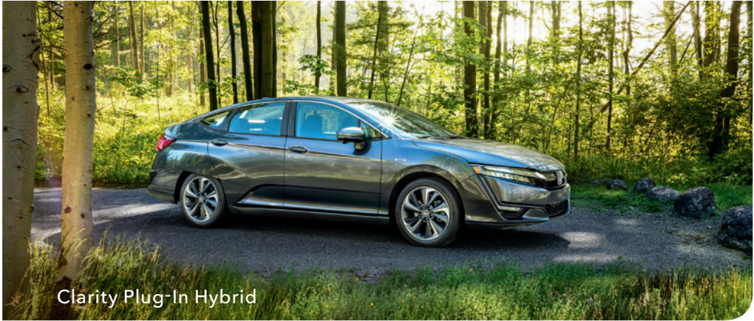
Clarity Plug-In Hybrid