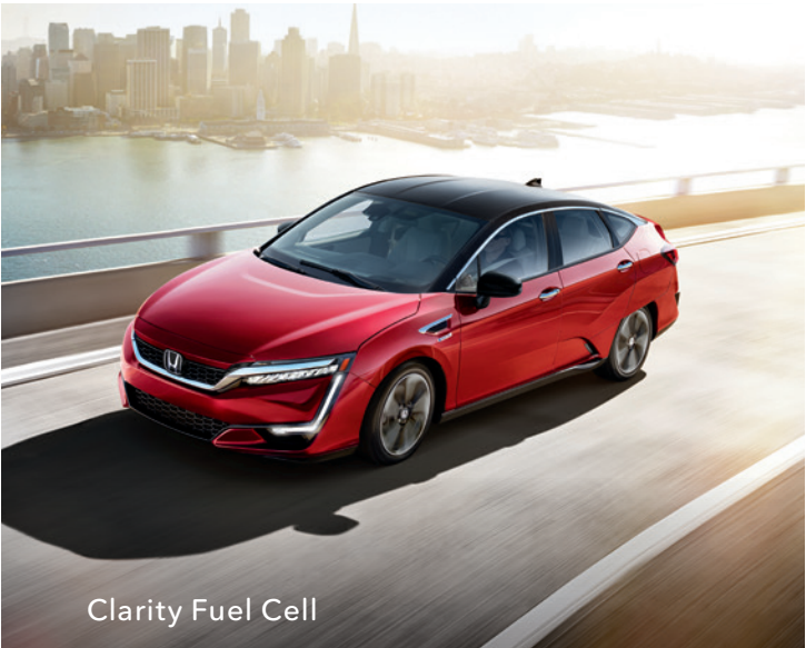
Clarity Fuel Cell