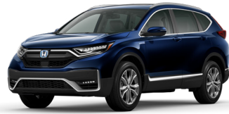
2020 Honda CR-V Hybrid