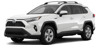
2020 RAV4 Hybrid

2020 Honda CR-V Hybrid (LX, EX, EX-L and Touring)